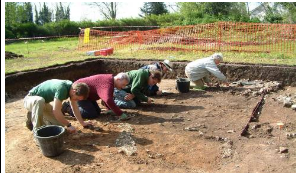
Investigating archaeological features: Ewell 2006

These five-day courses provide training in archaeological excavation and recording techniques, and include elements of initial finds processing and other aspects of archaeological investigation. No experience is necessary, and places on the training excavation are open to beginners as well as those with experience in archaeology.