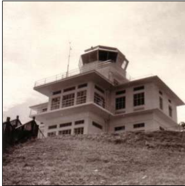
The New Tower

This life of luxury was not to last long as I was soon posted to RAF Tengah, another airfield on the far side of Singapore Island. Unexpectedly I was posted not to the tower but rather to the Flying Wing Operations Section. Not being too sure what to expect, I was very pleasantly surprised to find that it was the centre of operations of all air attacks against the Malayan Communist Party. I can't say that my time in the Royal Air Force was boring.