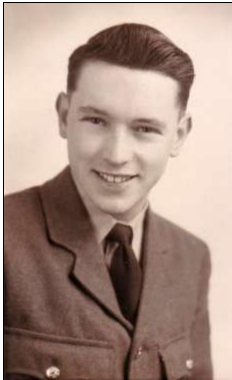
Obligatory photo for my Mother!

Watnall was a fantastic camp; just enough people of various trades solely to keep us functioning 'below stairs' 24 hours a day. Apparently the camp had won the Jolliff Trophy for catering many years on the trot and although it was not quite home cooking it was good. At least I wouldn't starve.