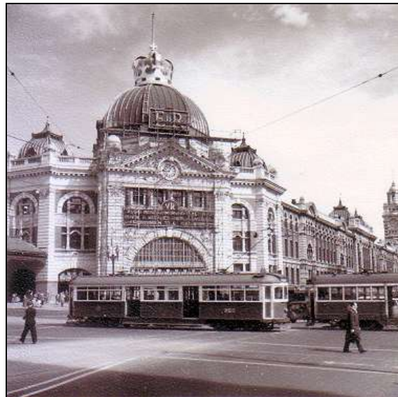
Flinders Street Railway Station