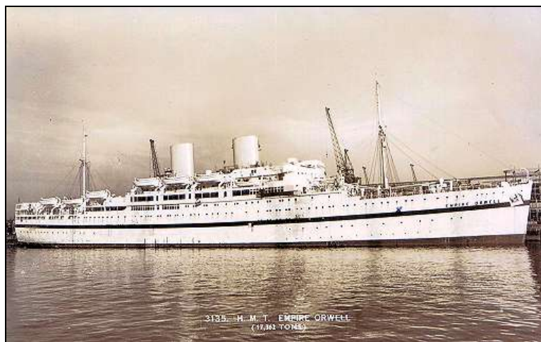
H.M.T. Empire Orwell (17,362 tons)

After a train journey to Southampton we boarded the Empire Orwell for our 'cruise' to Singapore. Bunks were assigned with the RAF on the upper decks and with the army units further down, some at the waterline level. Some did not even have a porthole to look through! We were all packed in and hoped that we would not have to get out in a hurry.