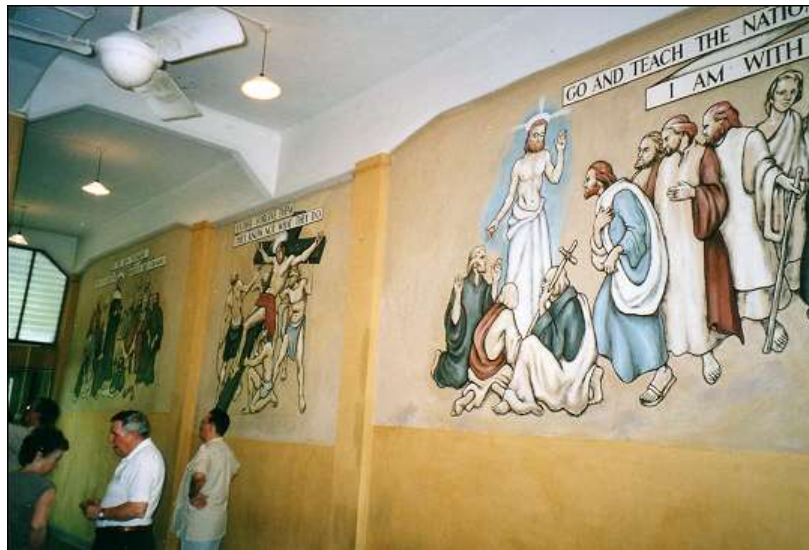
The restored Murals in 2006.

Some 50 years later I went back to Singapore together with my wife and a number of fellow members of the RAF Changi Association, and so much had changed that I hardly recognised the place. RAF Changi had all but been demolished with just Block 151 preserved to commemorate the P.O.W.'s