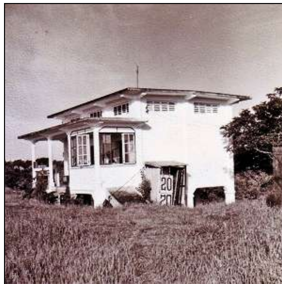
The Old Tower at RAF Changi

What I did not know until much later, I was now part of Operation Firedog, the code name for air operations in Malaya. My 'office' was in the Control Tower, an old building rather like a bungalow, built on the highest part of the airfield next to the gun emplacements built before World War Two. The guns faced out to sea where the main threat was expected to come from; however the Japanese attacked down Malay from the north.