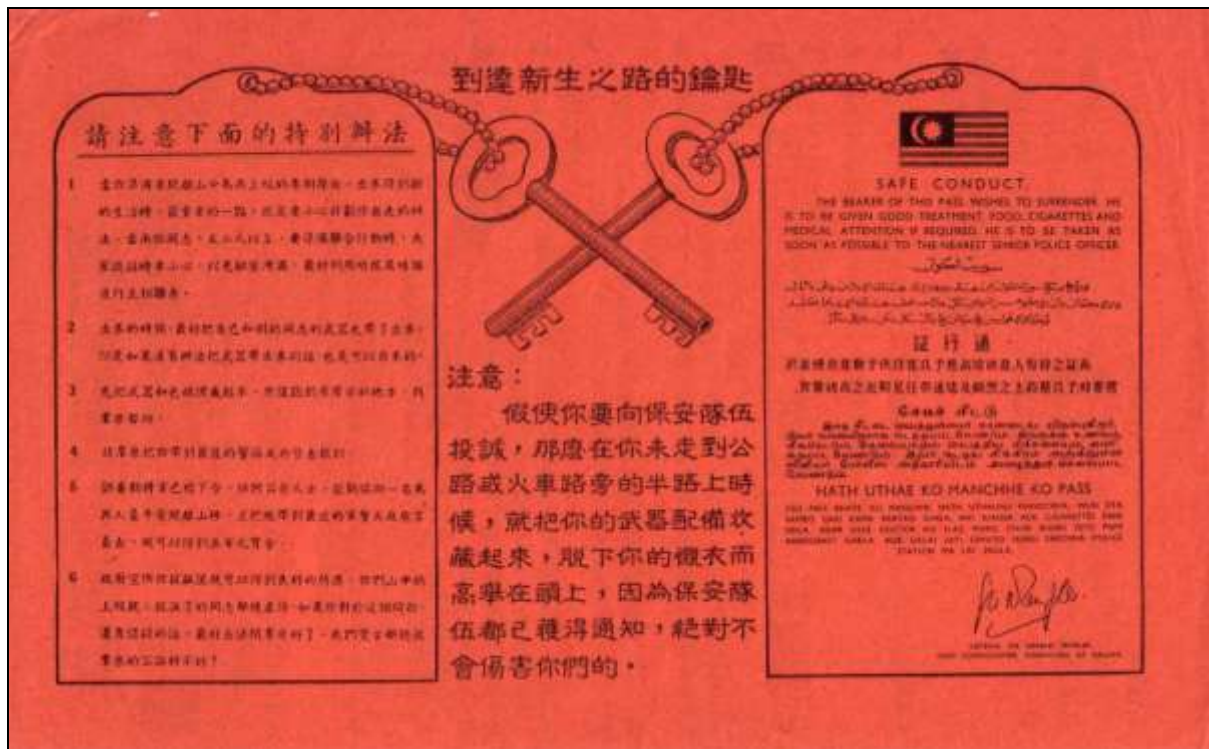
A safe conduct pass

There was some success but never enough and so the fight continued for a few more years after I left.