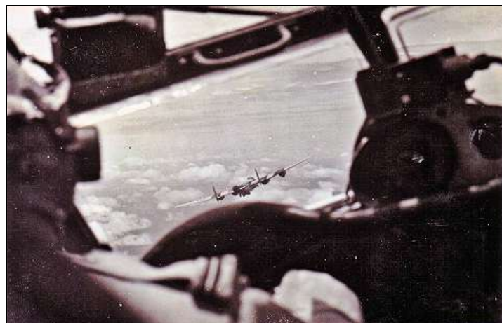
With 148 Squadron on raid on Jahore.

From here I was able to fly on familiarisation operations and as supernumerary crew in Lincolns of 148 Sqdn, No.1 Australian Sqdn. as well as local flights. Also a couple of trips in B 29's of the USAF, one of which had a coca cola machine in the rear area!